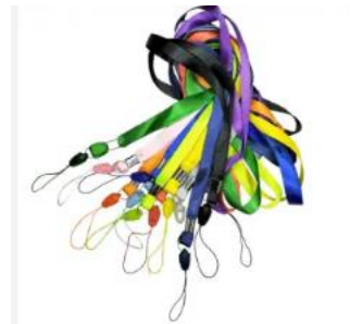
ID card jacket with lace