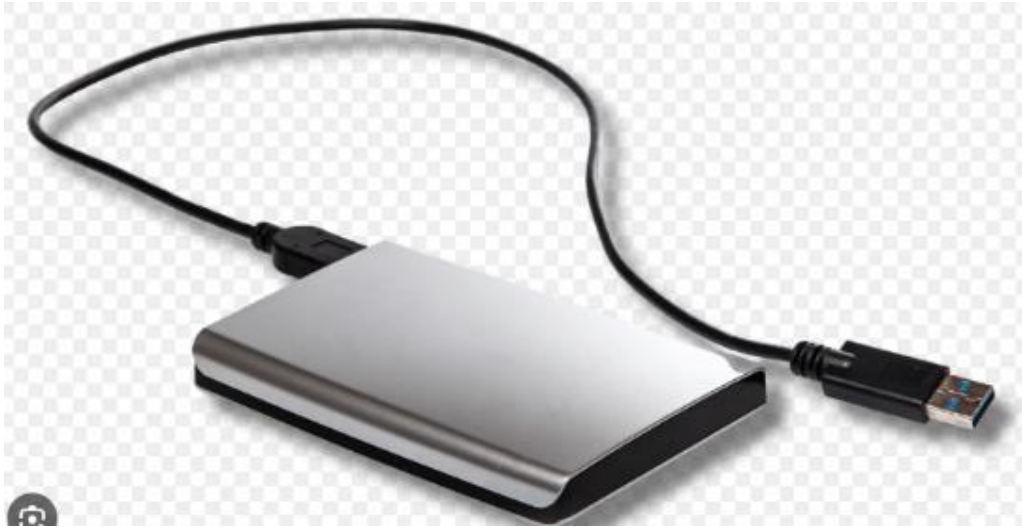
Portable external hard drive