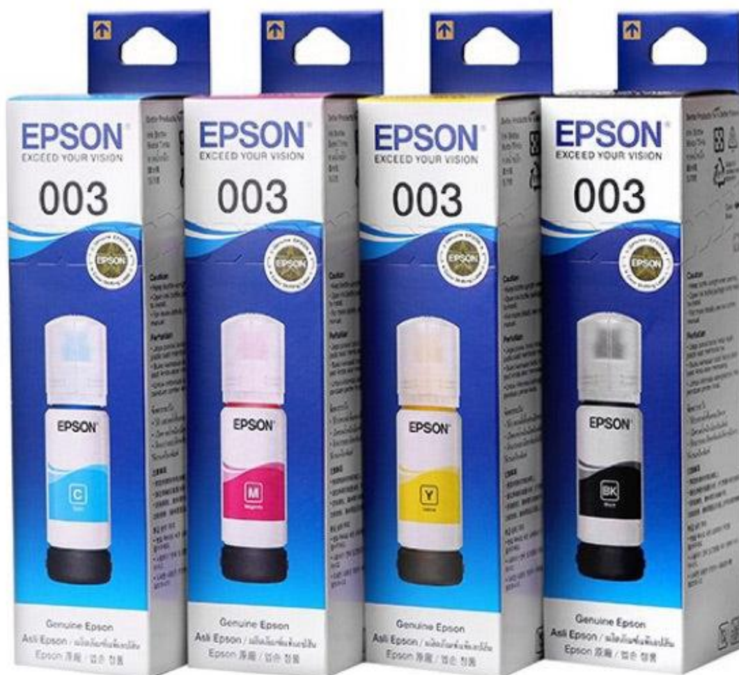
Ink, 003, Magenta, Cyan, Black and Yellow