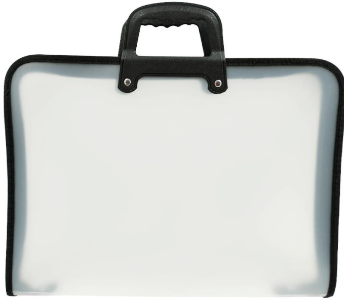
Envelope with handle