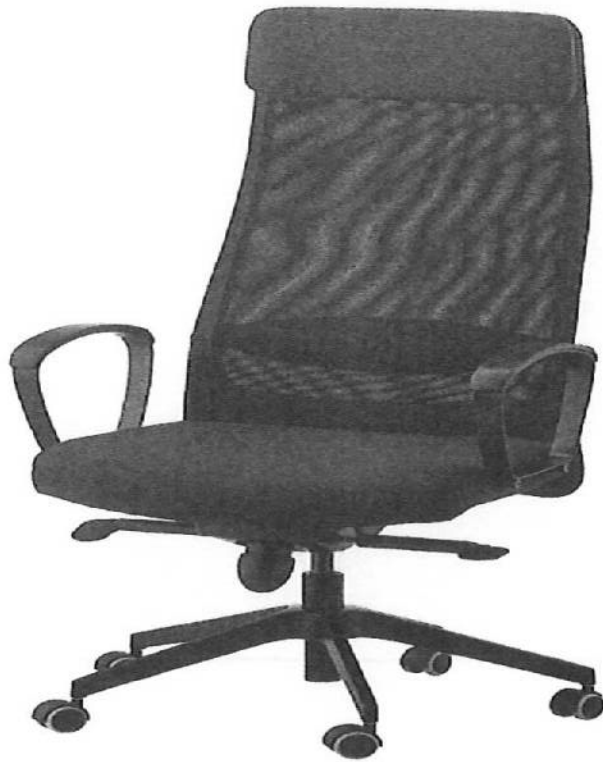
Chair, Computer Chair, Mesh, High Back, with Arm Rest