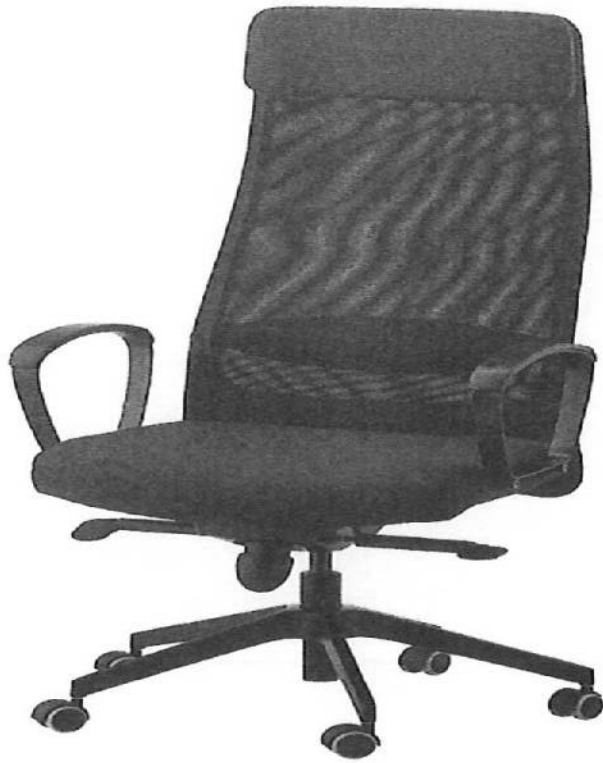
Chair, Computer Chair, Mesh, High Back, with Arm Rest