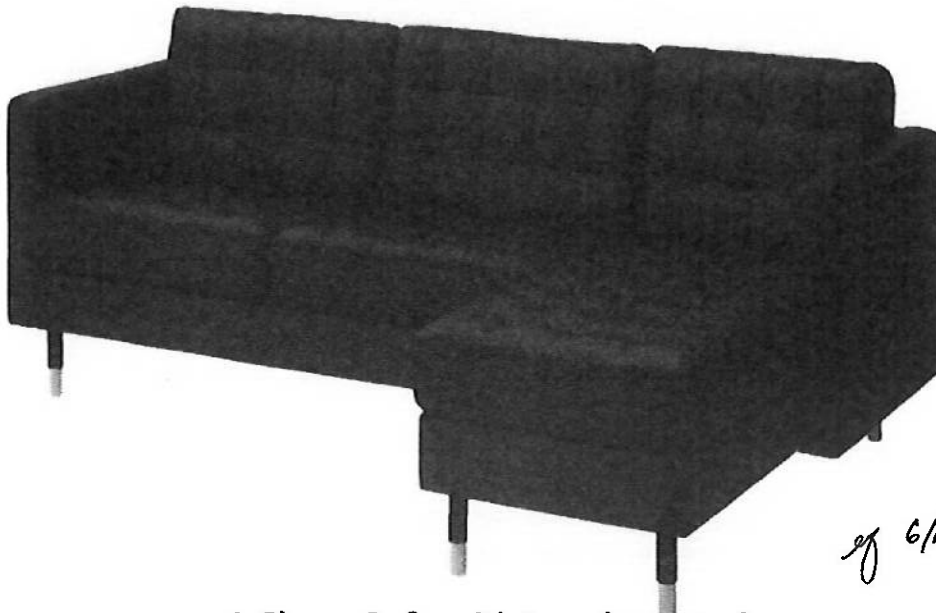
L-Shape Sofa with Legs (3 seater)