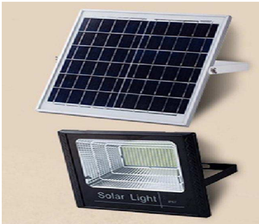
Solar Flood light (100 watts)