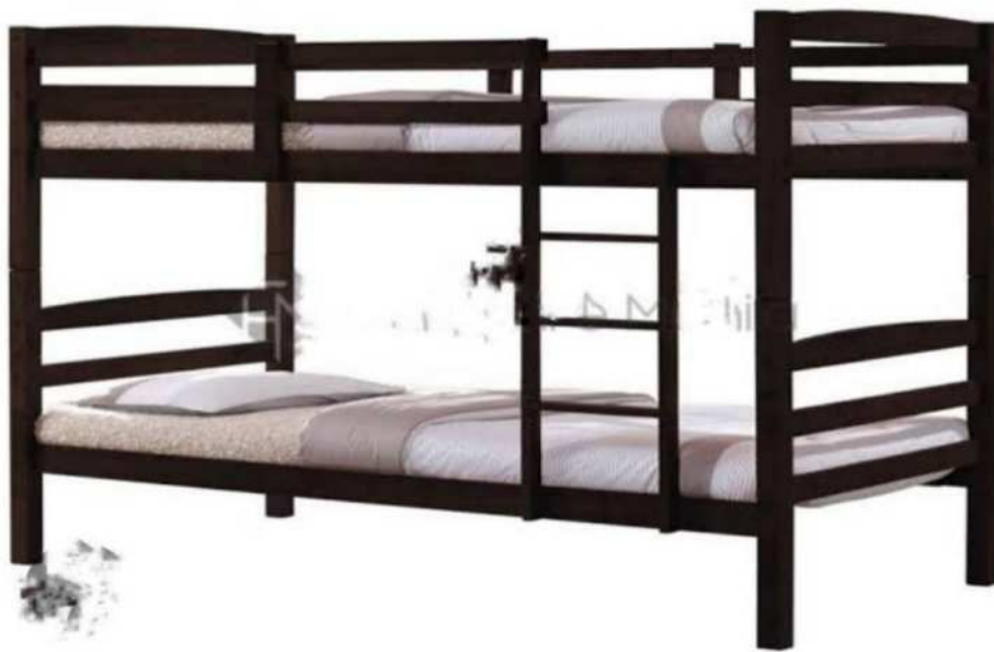
2 pcs – double deck