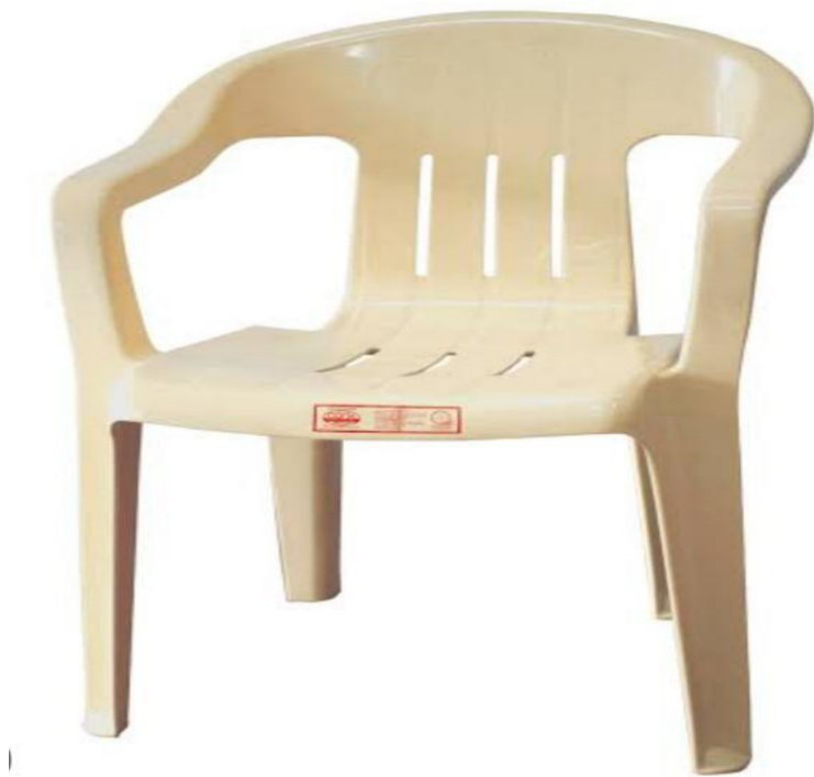
6 pcs - chairs