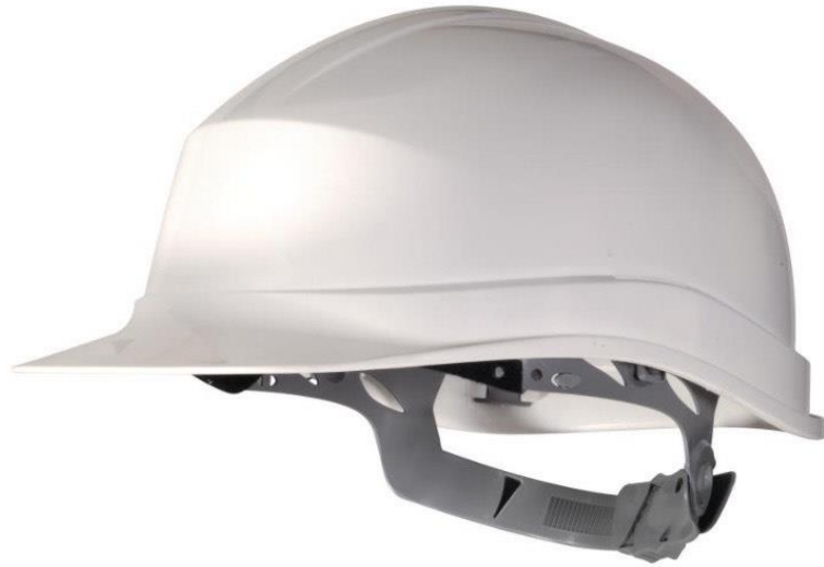
Safety Hard Hat