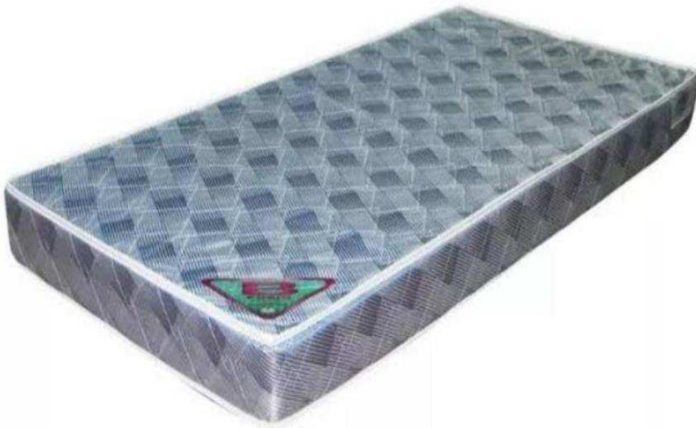
2 pcs - foam