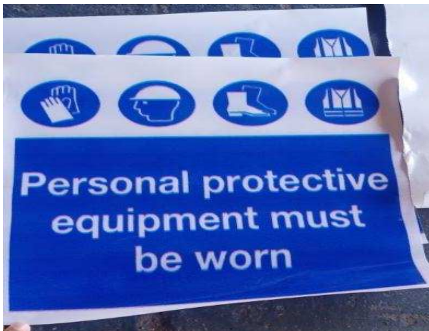
PPE must be worn