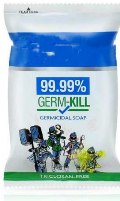
Bar Soap (for anti bacteria handwashing)