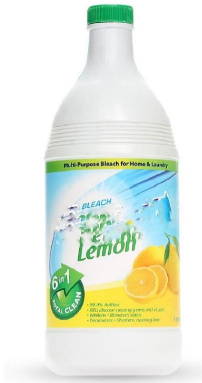
Disinfectant (5% Bleach Solution), 1 liter