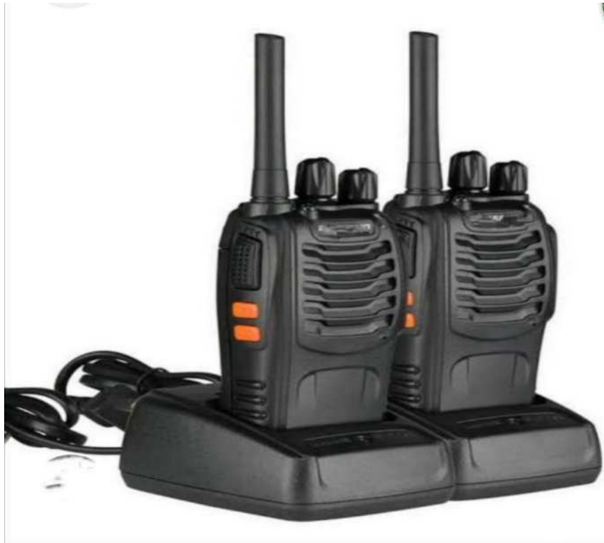
Two-way Radio Communication