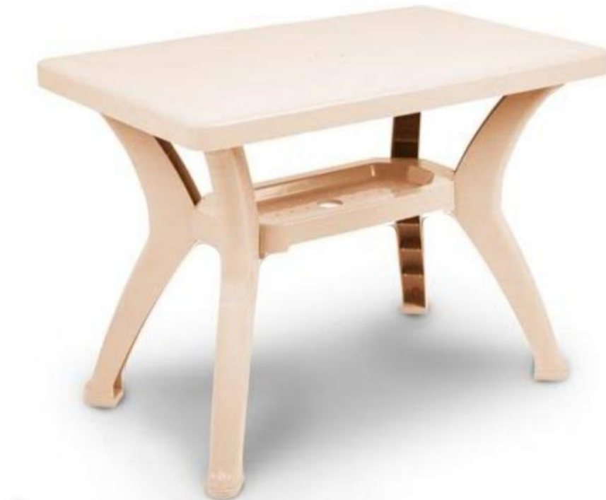
1pc - table