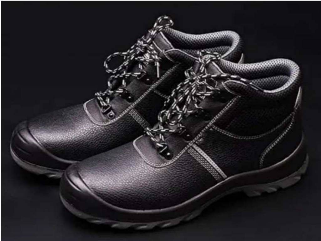
Safety Shoes, steel toe, (color brown/black)