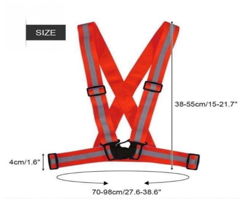
ReflectORIZED Vest adjustable/garter skeleton type