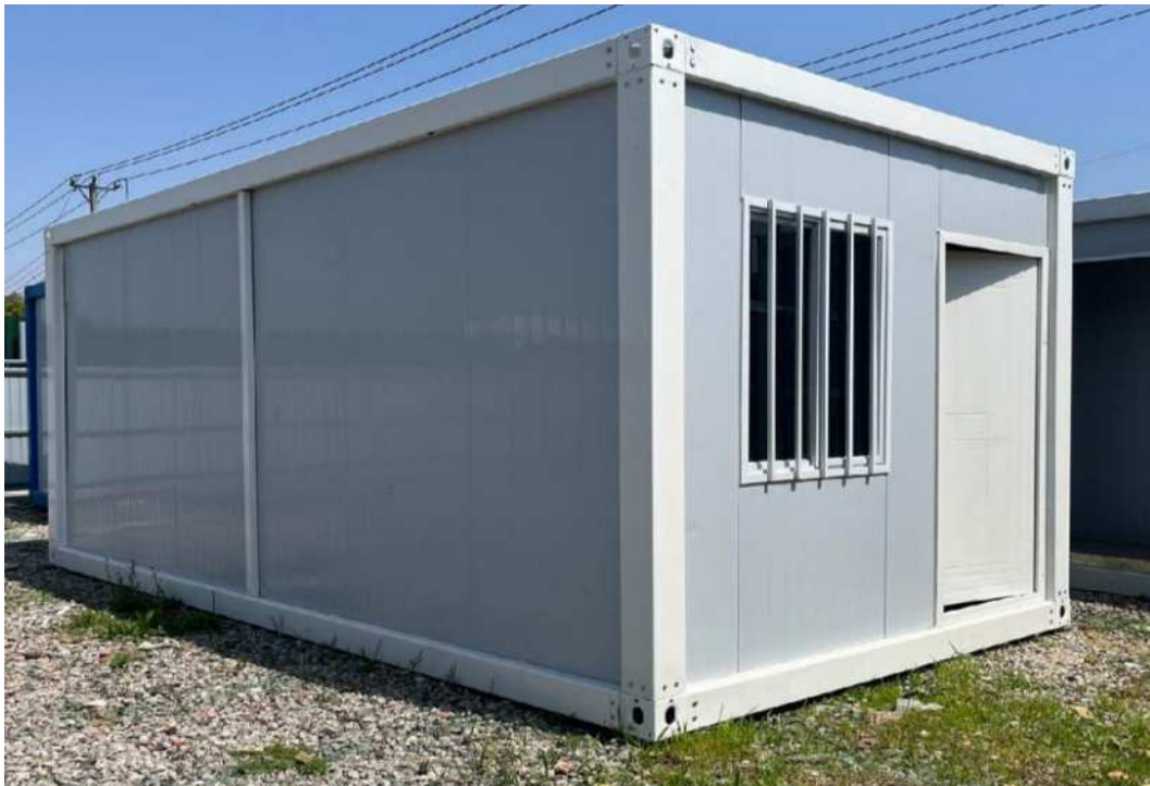
3 unit - Collapsible Bunkhouse