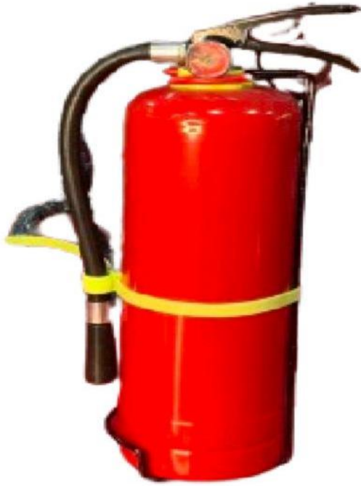
Fire Extinguisher (color red)