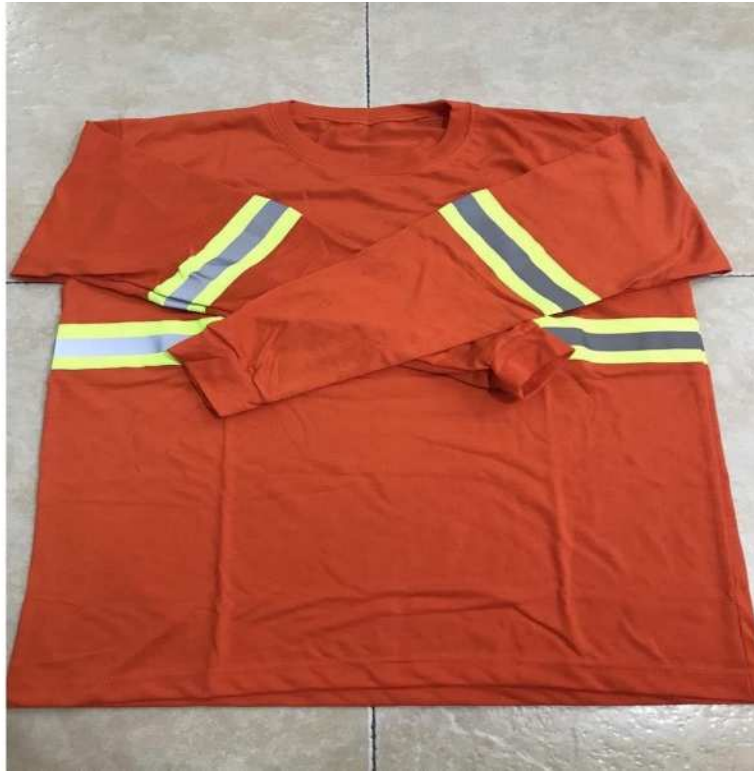
Working Clothes – Orange long sleeves with DPWH Logo