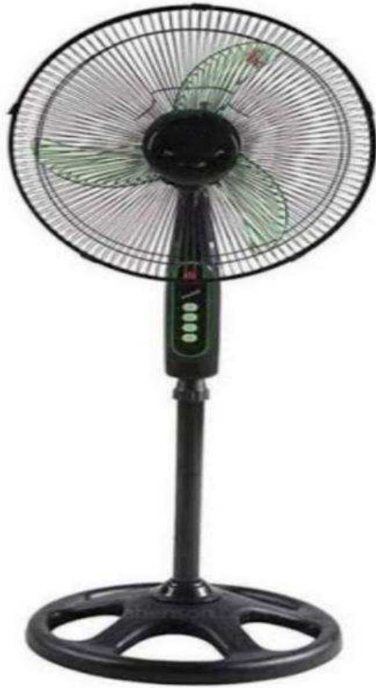
2 units – electric fan (standfan)