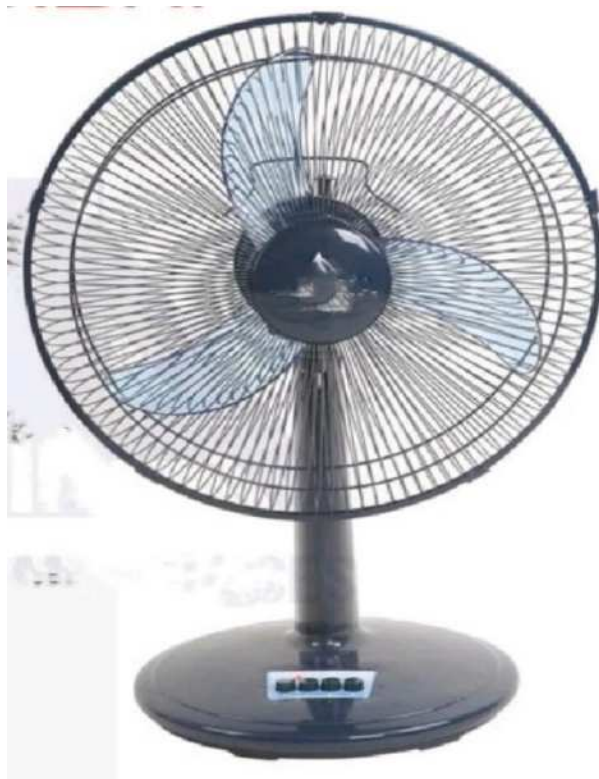
1 unit - Electric fan