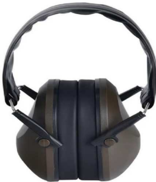
Safety Earmuffs Noise Reduction