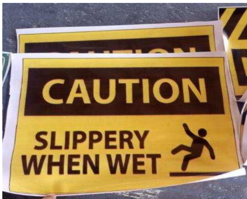
Caution: Slippery when Wet