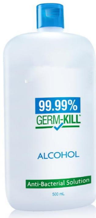
Alcohol, 500 ml