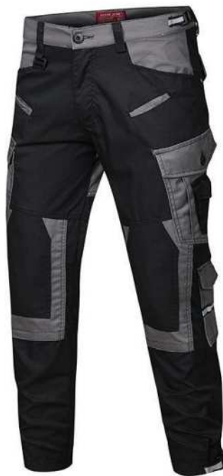
Black Tactical Cargo Pants