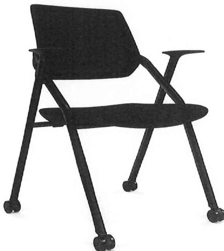
Chair, Free Function, Foldable