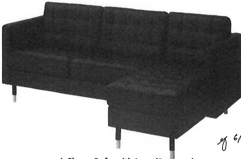
L-Shape Sofa with Legs (3 seater)