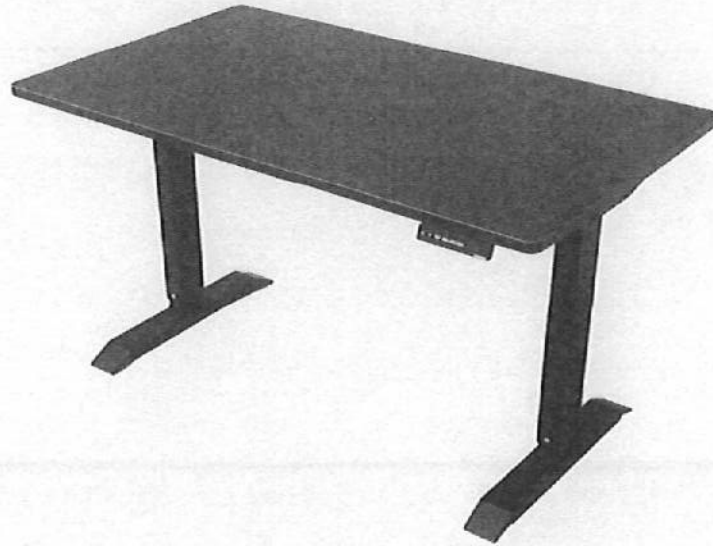
Electric Standing Desk, Adjustable, Motorized