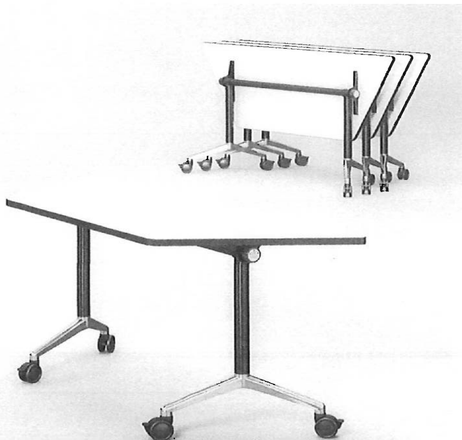
Foldable Training Table, Lightweight, 80 x 60 x 75 cm