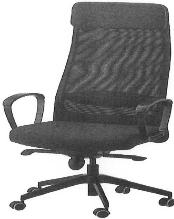
Chair, Computer Chair, Mesh, High Back, with Arm Rest