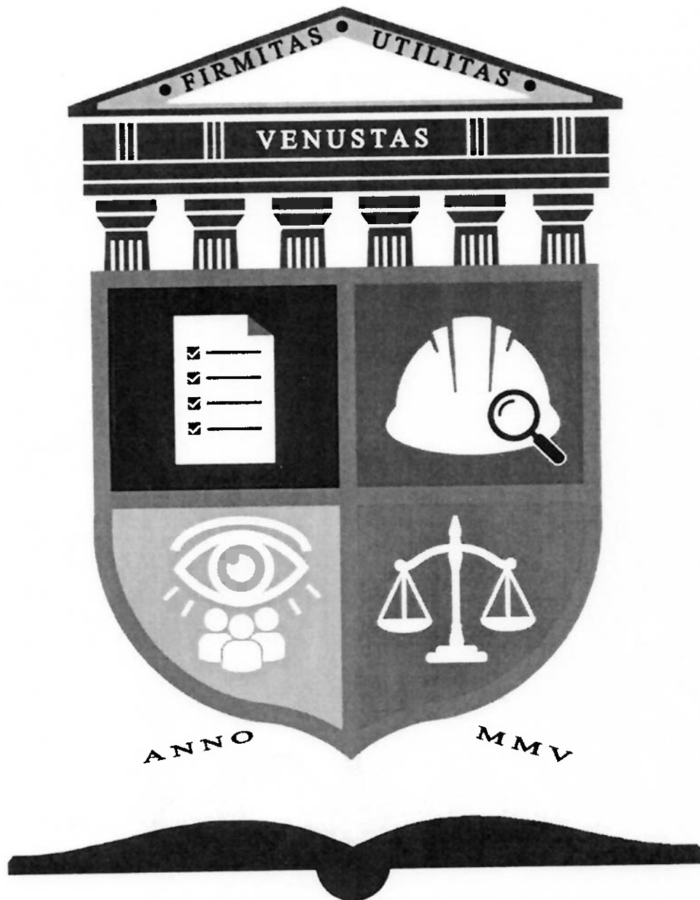
Proposed NBCDO Logo