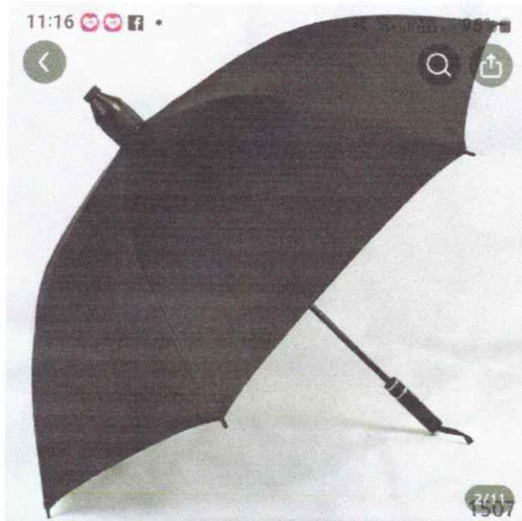
UMBRELLA HEAVY DUTY NOT FOLDED