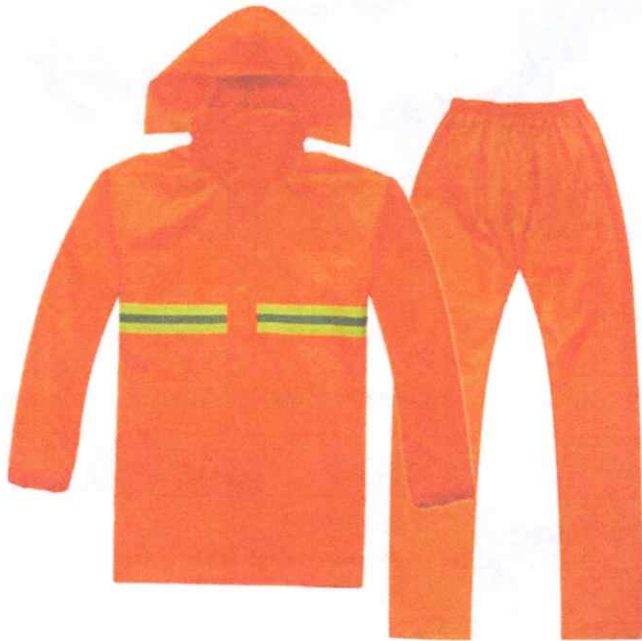
RAIN COAT HD (JACKET AND PANTS)