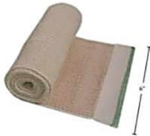
Elastic Bandage, woven elastic cloth made of cotton and synthetic thread (6inchesx5yards)