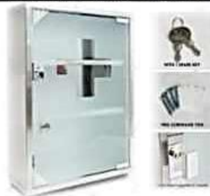
First Aid Cabinet, Stainless Steel with glass door, Dimensions: Height 45cm X Length 12cm X Width 30cm, Magnetic Soft-Push Door, Safety Lock, made from durable materials to withstand daily use and ensure longevity, Easy to mount on walls, saving valuable floor space and ensuring quick access in emergencies (for various offices)