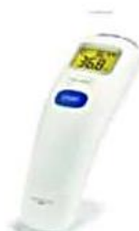
Gun type Digital Forehead Thermometer for Body Temperature, Silent Mode, Width: 6.8mm, Height: 22mm, Depth: 11.6mm