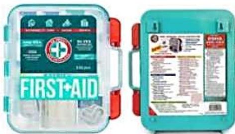
First Aid Kit consisting 330pcs components (for various service vehicles)