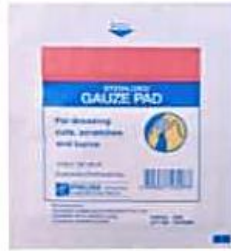
Gauze Pads 4'cmx4'cm by 8ply