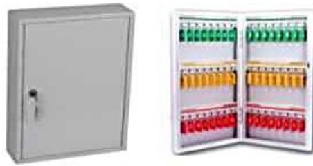
Heavy Duty, Aluminum alloy Safe Key Cabinet, Box Storage Organizer, 48keytags, 276Wx480Hmm