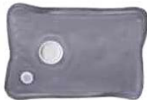
Electrothermal water bag/hot compress