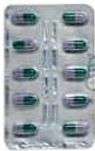
Loperamide capsule, 2mg