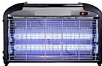
Electric Mosquito (Insects) Killer Device, Two 15W T8 UV-A Tube; Coverage Area: 80 SQM; Killing Voltage: 1400V, 220-240VAC 50/60Hz; Product Dimension: 51.5x7x26cm