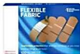
Adhesive Bandages, washproof, breathable 100pcs per box