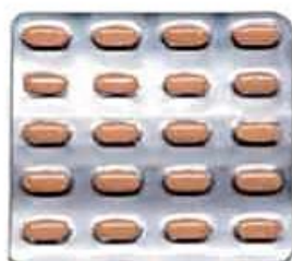
Paracetamol Tablets, 500mg