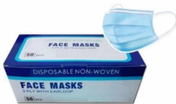
Face mask (50 pcs/box)