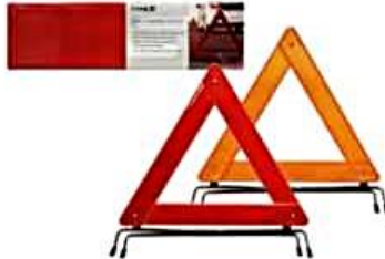
Early Warning device, Dual Warning Reflective Triangle Warning Sign, Heavy Duty LTO Standard of 1.25kg per triangle, Highly reflective material, visible up to approximate 400m; Sturdy, wide spaced legs ensure maximum stability - does not tip over by strong wind; Easy storage, foldable design; Anti-rust treatment in all metal parts Height (Triangle w/Stand):38cm