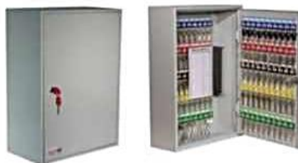
Heavy Duty, Aluminum alloy Safe Key Cabinet, Box Storage Organizer, 96keytags, 398Wx630Hmm