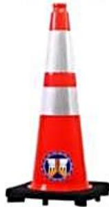
Traffic Cone with DPWH Logo, heavy duty, with two Reflective tape with a bandwidth of 150mm; 28inches"H, 6.1 lbs.; Color: Orange; with 6"reflectorized waterproof