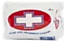
Cotton, 25 grams