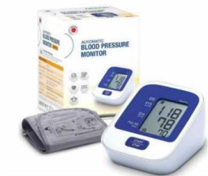
Digital Blood Pressure Monitor Automatic