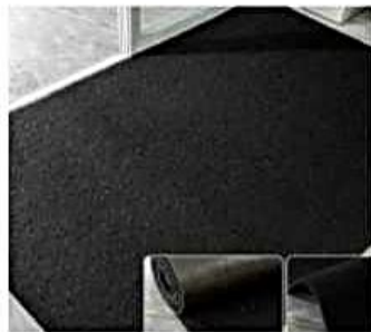
Anti-slippery, Rubber Matting loop spaghetti, PVC Rubber Coil, 4ft width; color: black, Heavy duty material, Fire retardant - made of flame retardant material that prevents cigarette burns, Dirt Trapping capability