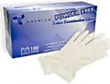
Gloves Latex, thick material