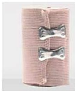
Elastic Bandage, woven elastic cloth made of cotton and synthetic thread (2inchesx5yards)