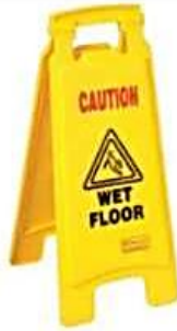
Caution Wet Floor Sign – 2 Sided, Width: 11"; Depth: 12"; Height: 25"; Color Finish: Yellow; Type: 2 Sided, heavy duty