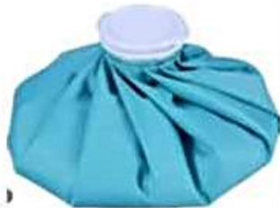
Ice Bag for cold compress, Size: 6 inches, Material: Polyester + PVC, Soft elastic fabric material, lid is large, easy to open, and completely closed without water seepage when in use, can stay hot and cold for a long time, light weight