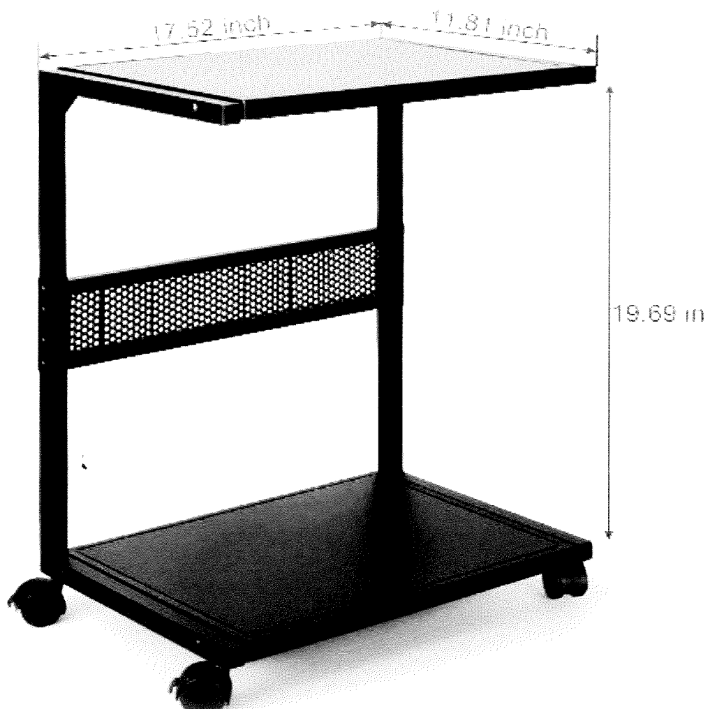
2-Tier Metal CPU Stand with Locking Caster Wheels